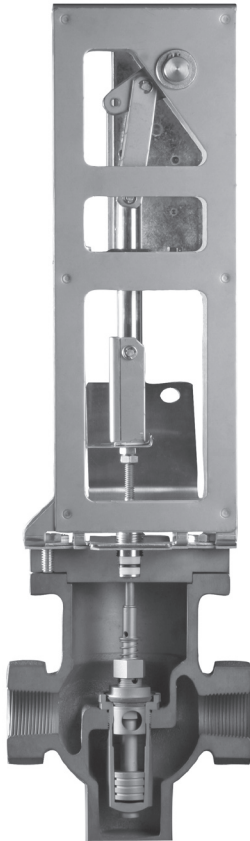
Cutaway View of Electronic Actuator and Valve

AERCO's electronic controls package maintains \pm 2^{\circ}\text{F} temperature control when units are operated under constant load conditions and deliver \pm 4^{\circ}\text{F} temperature control under normal load changes.