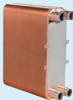
Single-Wall, Brazed Plate Heat Exchanger