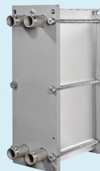
Double-Wall, Plate and Frame Heat Exchanger